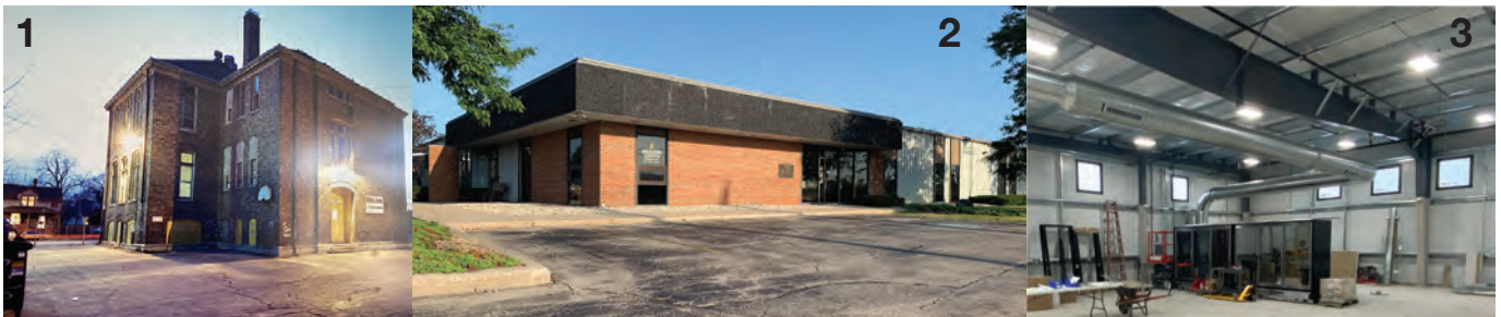
Many years, different buildings, the same mission. 1) The original 100-year-old school building that housed Shalom Center until 2017. 2) Our 2017 new building off of 39th Avenue. 3) The 2020 addition to Shalom Center that relocated the food pantry and warehouse to our 39th Avenue building.

We were founded in 1982 by a coalition of people concerned about individuals facing hunger, poverty, and homelessness in the community. The first program was the Soup Kitchen. We first began providing shelter to families in a 100-year-old school building in 1990. In 1992, we began to partner with local churches to open their basements for temporary respite forming what we now call Individuals Needing Nightly Shelter or 'INNS'. In 2017, Shalom Center relocated to a modern facility allowing for both shelter programs to be under one roof. In 2020, we relocated our food pantry to our 39th Avenue location.