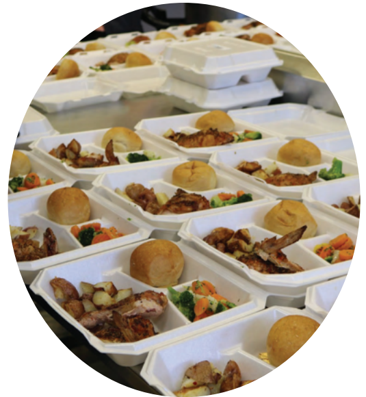
The pandemic required us to shift our kitchen into a "To Go" model. We worked hard to continue to provide delicious and healthy nightly meals!

Shalom Center operates one of the longest running nightly meal program. Even amidst this challenging time, we kept our doors open to ensure that we could feed those who came to us. This commitment stems from our desire to address the food desert in Kenosha. The term 'food desert' is used to describe an area in a community where access to fresh-healthy-and affordable food is significantly limited. In Kenosha, there are pockets across our community blighted by a food desert. That's where Shalom Center has been a resource called upon by those in need across our community.